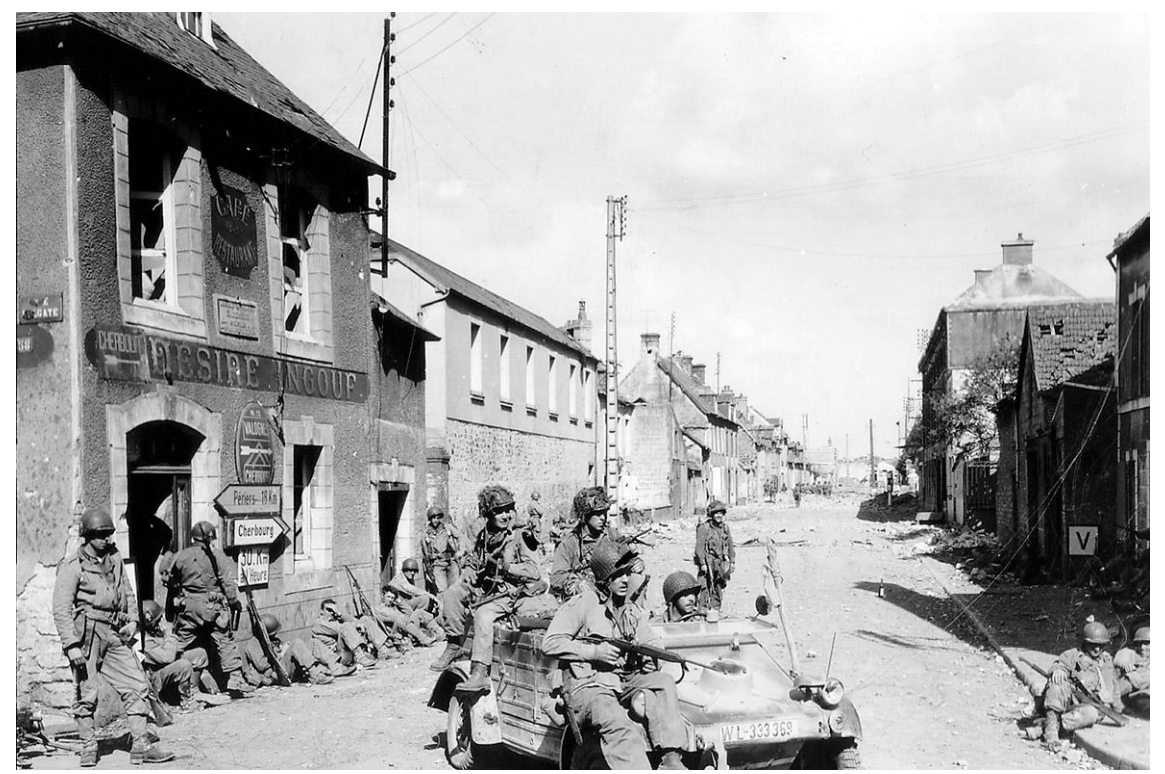
June 6, 1944: US Army paratroopers of the 101st Airborne Division drive a captured German Kubelwagen at the junction of Rue Holgate and RN13 in Carentan, France