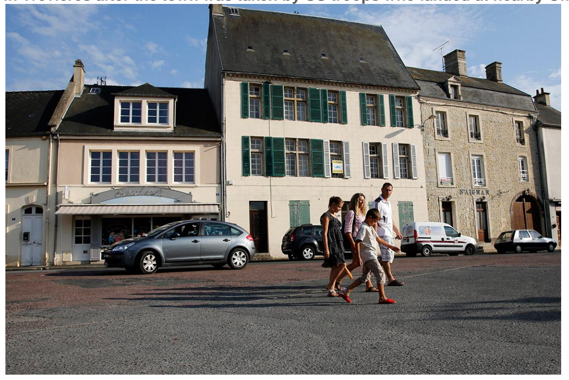
Tourists walk across the main square of Place Du Marche in Trevieres, near the former D-Day landing zone of Omaha Beach