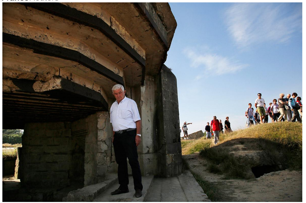
An Italian tourist views a bunker at a strategic site overlooking the D-Day beaches which had been captured by US Army Rangers at Pointe du Hoc, France