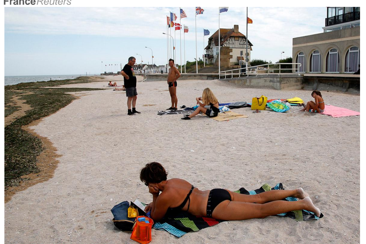
A tourist sunbathes on a former Juno Beach landing area where Canadian troops came ashore on D-Day at Bernieres Sur Mer, France