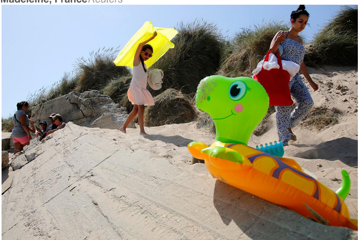
Children walk over the remains of a concrete wall on the former Utah Beach D-Day landing zone near La Madeleine, France