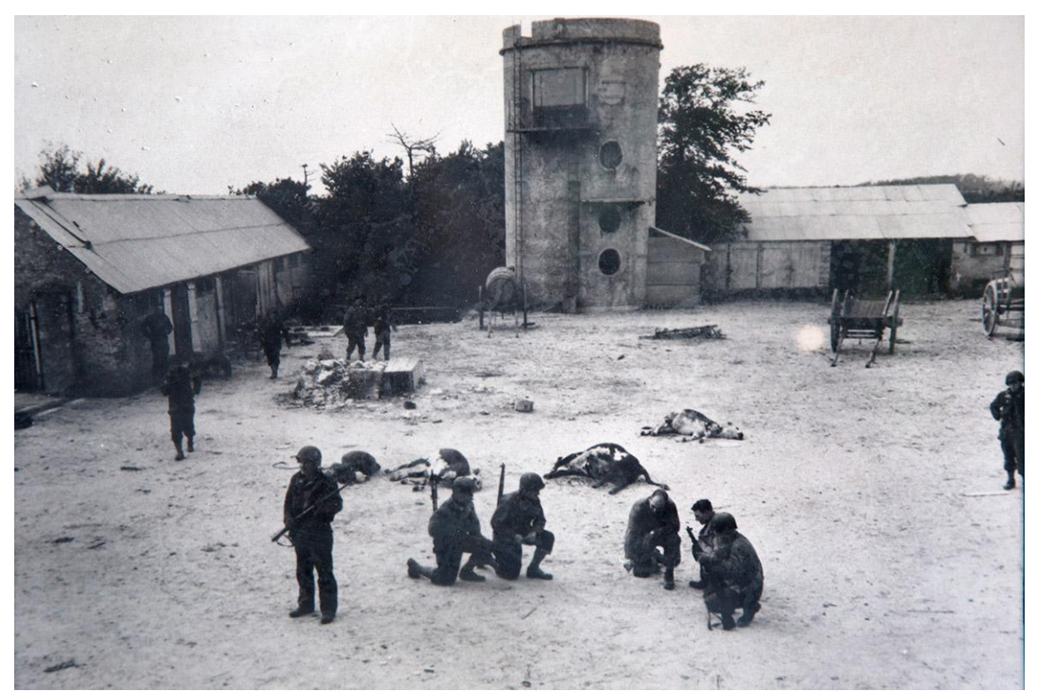
June 6, 1944: US Army troops make a battle plan in a farmyard amid cattle, killed by artillery bursts, near the D-Day landing zone of Utah Beach in Les Dunes de Varreville, France