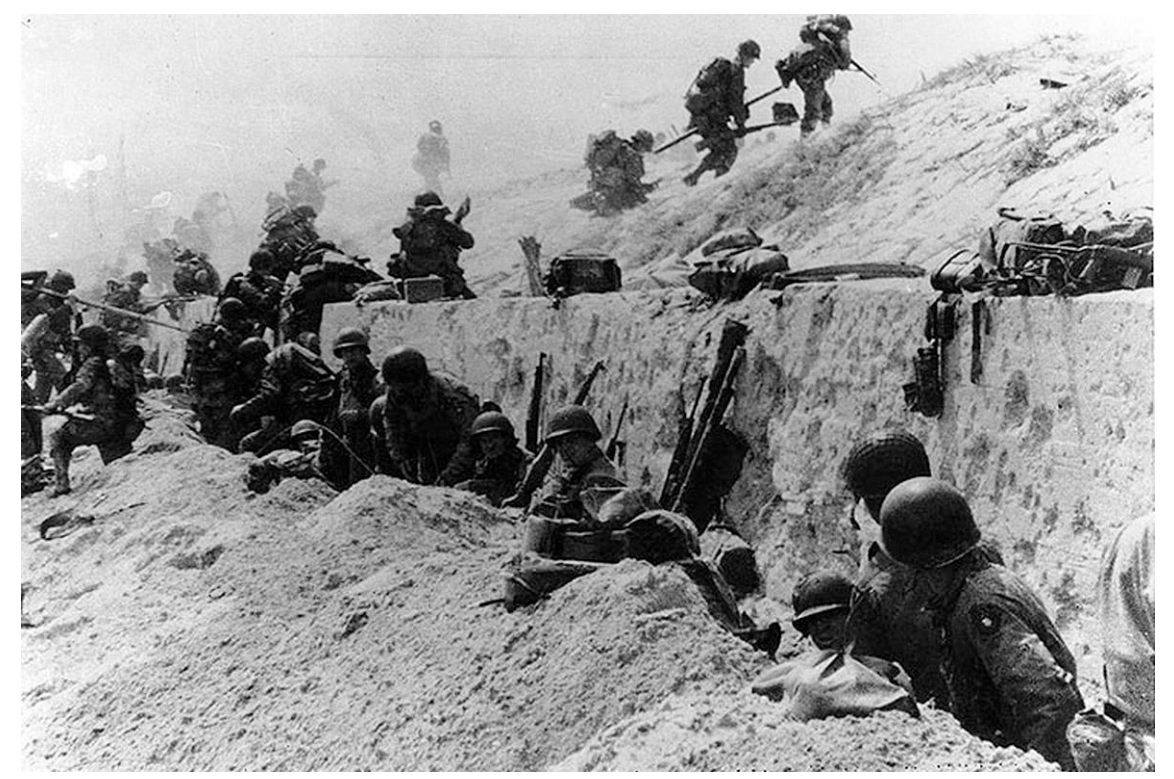
June 6, 1944: US Army soldiers of the 8th Infantry Regiment, 4th Infantry Division, move out over the seawall on Utah Beach after coming ashore in front of a concrete wall near La Madeleine, France