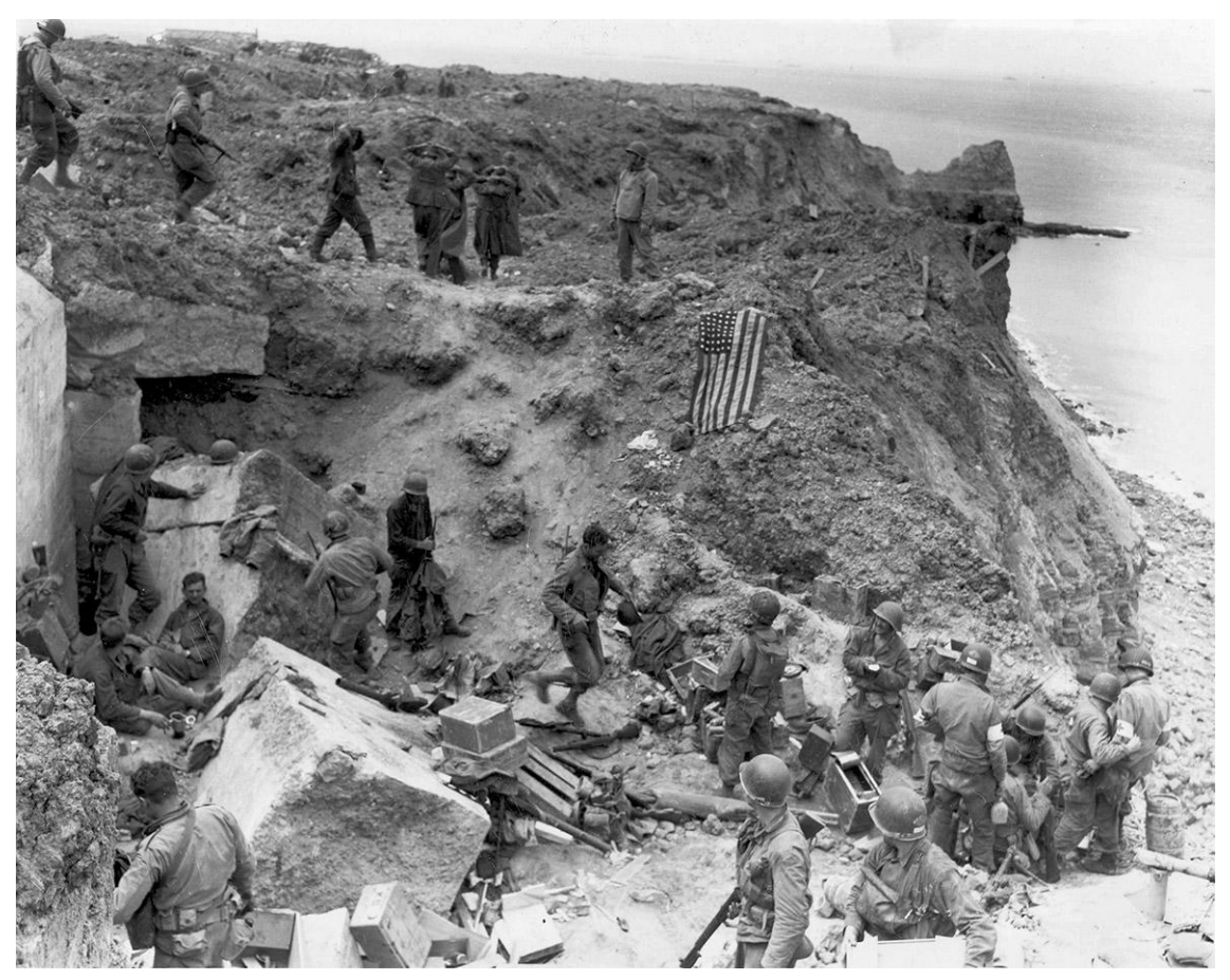
June 8, 1944: A US flag lies as a marker on a destroyed bunker two days after the strategic site overlooking D-Day beaches was captured by US Army Rangers at Pointe du Hoc, France