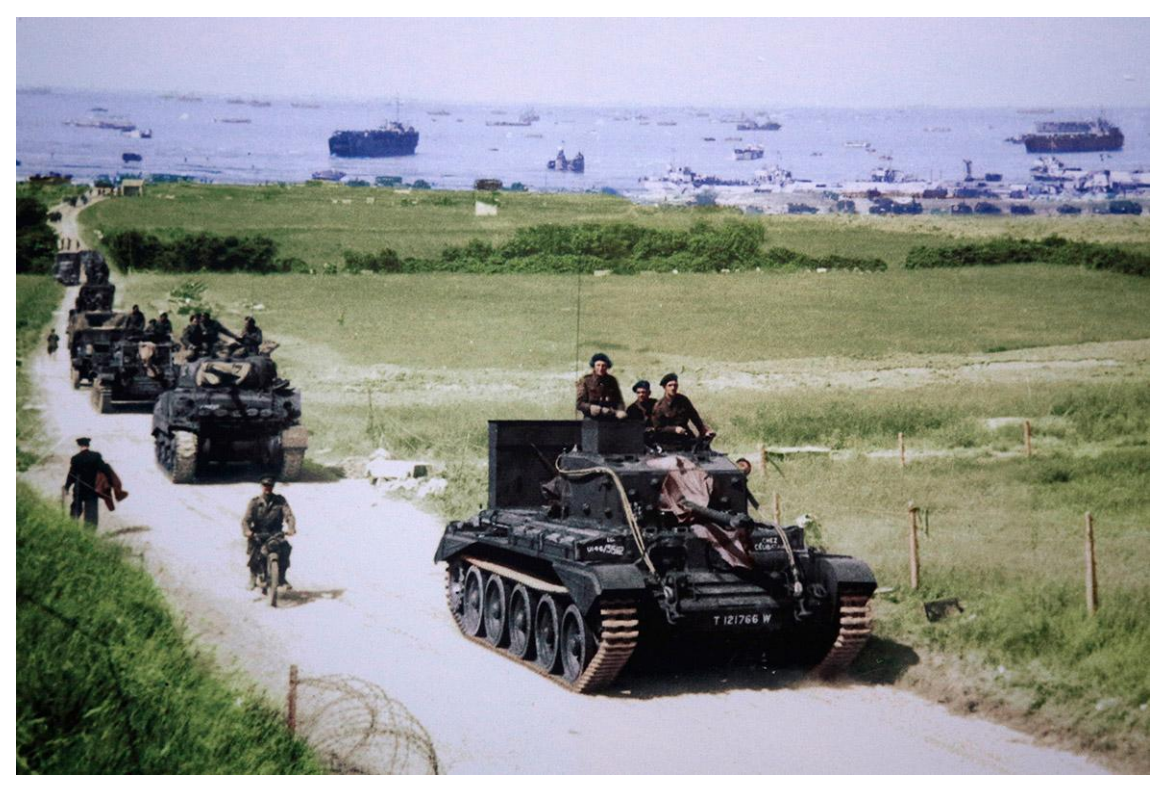
June 6, 1944: A Cromwell tank leads a British Army column from the 4th County of London Yeomanry, 7th Armoured Division, after landing on Gold Beach on D-Day in Ver-sur-Mer, France