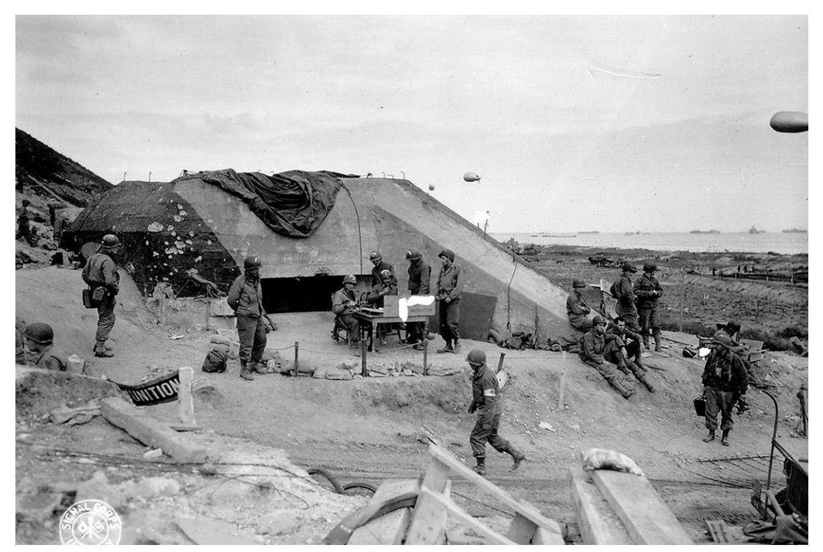
June 7, 1944: US Army troops congregate around a signal post used by engineers on the site of a captured German bunker overlooking Omaha Beach after the D-Day landings near Saint Laurent sur Mer