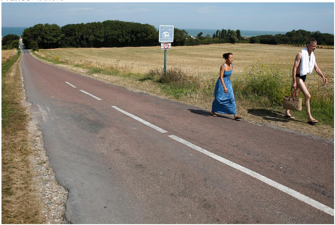
A couple walk inland from the former D-Day landing zone of Gold Beach where British forces came ashore in 1944, in Ver-sur-Mer, France