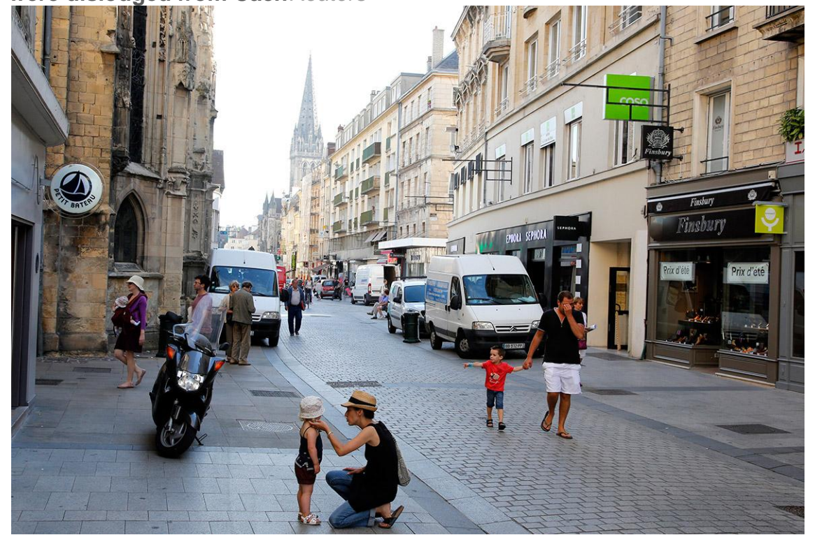
Shoppers walk along the rebuilt Rue Saint-Pierre in Caen, which was destroyed following the D-Day landings