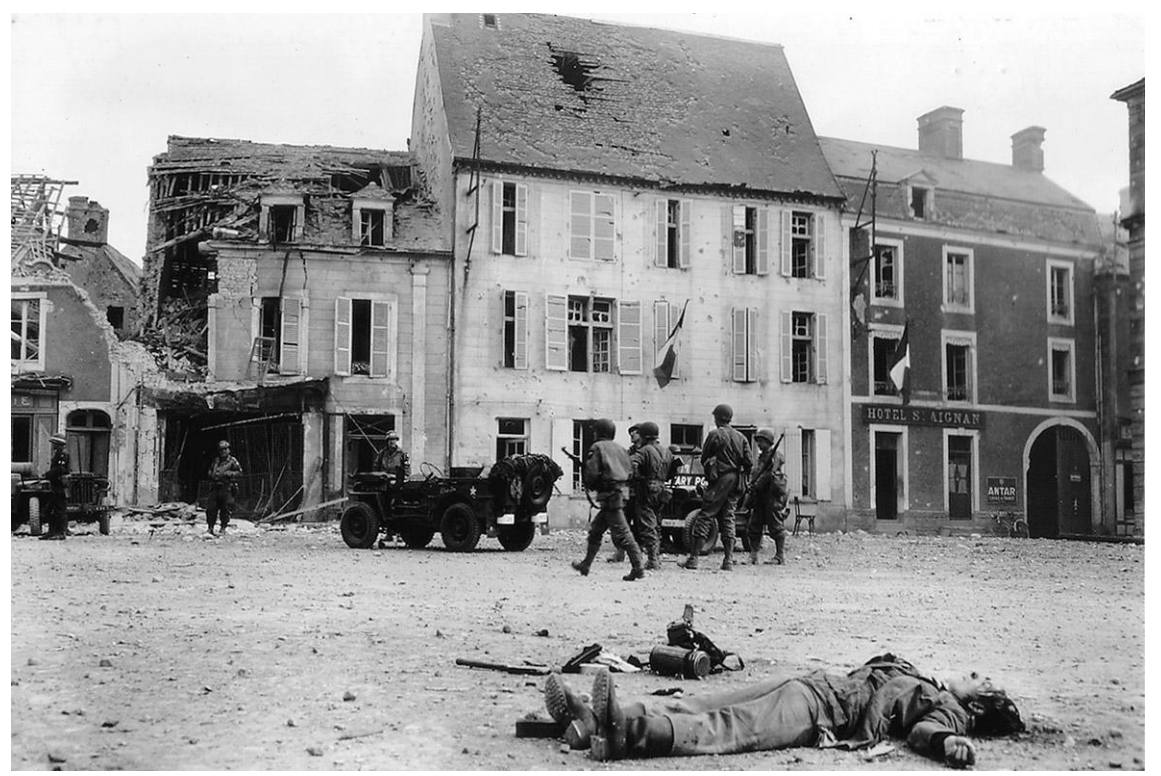
June 15, 1944: The body of a dead German soldier lies in the main square of Place Du Marche in Trevieres after the town was taken by US troops who landed at nearby Omaha Beach