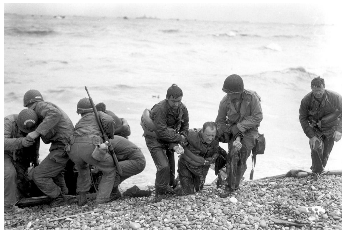
June 6, 1944: Members of an American landing party assist troops whose landing craft was sunk by enemy fire off Omaha beach, near Colleville sur Mer, France