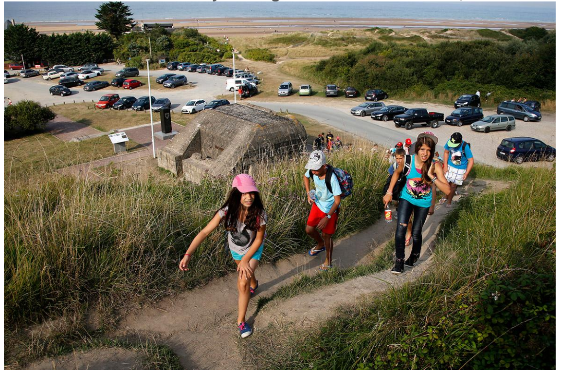
Youths hike up a hill past an old German bunker overlooking the former D-Day landing zone of Omaha Beach near Colleville sur Mer, France