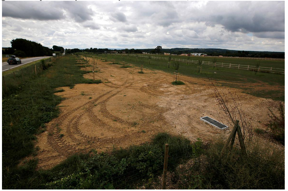
A farm field remains where German prisoners of war were interned following the D-Day landings in Nonant-le-Pin, Normandy Reuters

August 21, 1944: German prisoners of war captured after the D-Day landings in Normandy are guarded by US troops at a camp in Nonant-le-Pin, France Reuters