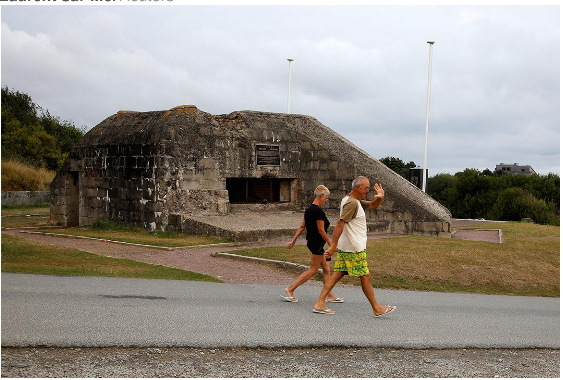
Tourists walk past a former German bunker overlooking the D-Day landing zone on Omaha Beach near Saint Laurent sur Mer, France