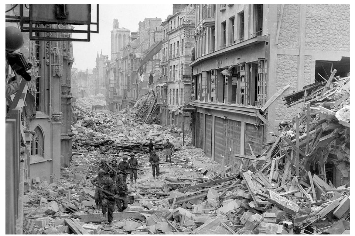
July 1944: Canadian troops patrol along the destroyed Rue Saint-Pierre after German forces were dislodged from Caen