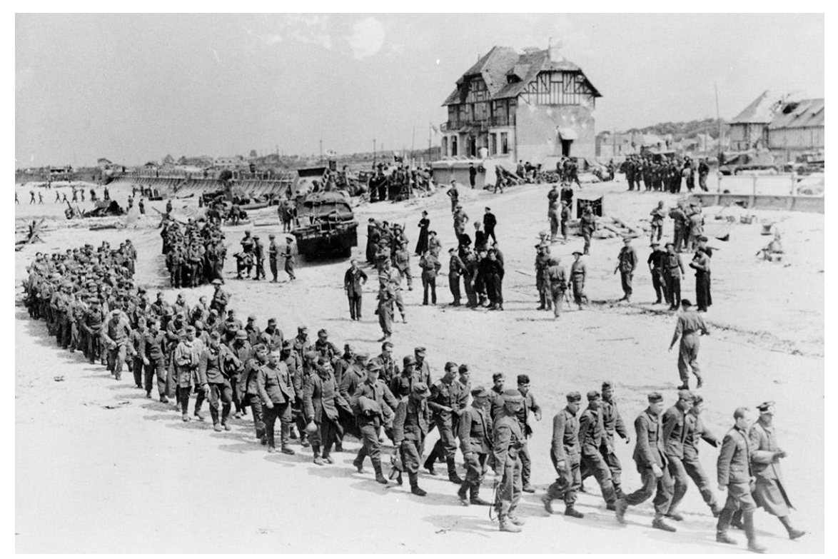
June 6, 1944: German prisoners-of-war march along Juno Beach landing area to a ship taking them to England, after they were captured by Canadian troops at Bernieres Sur Mer, France