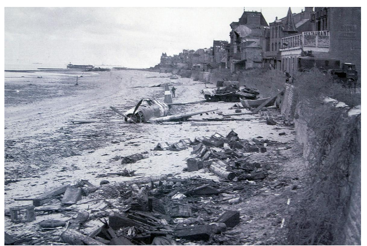
June 194: A crashed US fighter plane is seen on the waterfront some time after Canadian forces came ashore on a Juno Beach D-Day landing zone in Saint-Aubin-sur-Mer, France