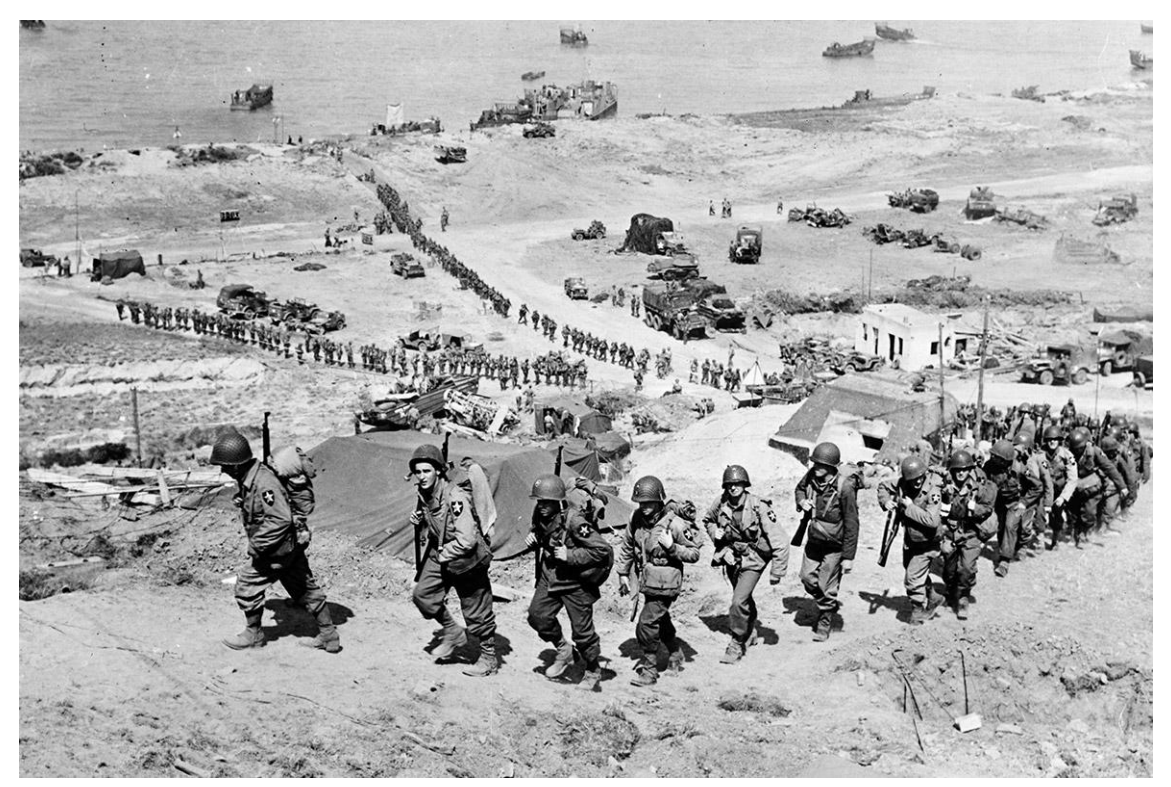
June 18, 1944: US Army reinforcements march up a hill past a German bunker overlooking Omaha Beach after the D-Day landings near Colleville sur Mer, France