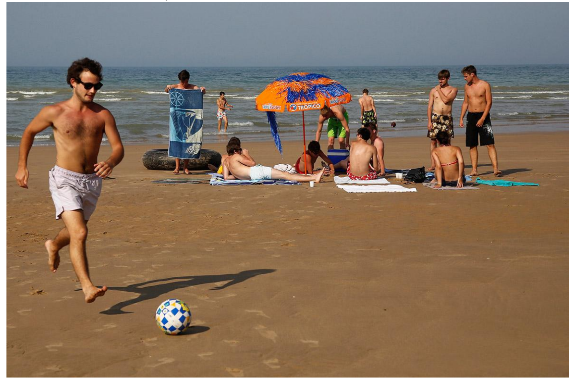
Holidaymakers enjoy the sunshine on the former D-Day landing zone of Omaha beach near Vierville sur Mer, France