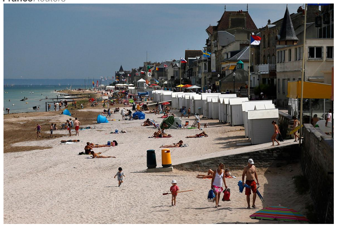
Tourists enjoy the sunshine on the former Juno Beach D-Day landing zone, where Canadian forces came ashore, in Saint-Aubin-sur-Mer, France