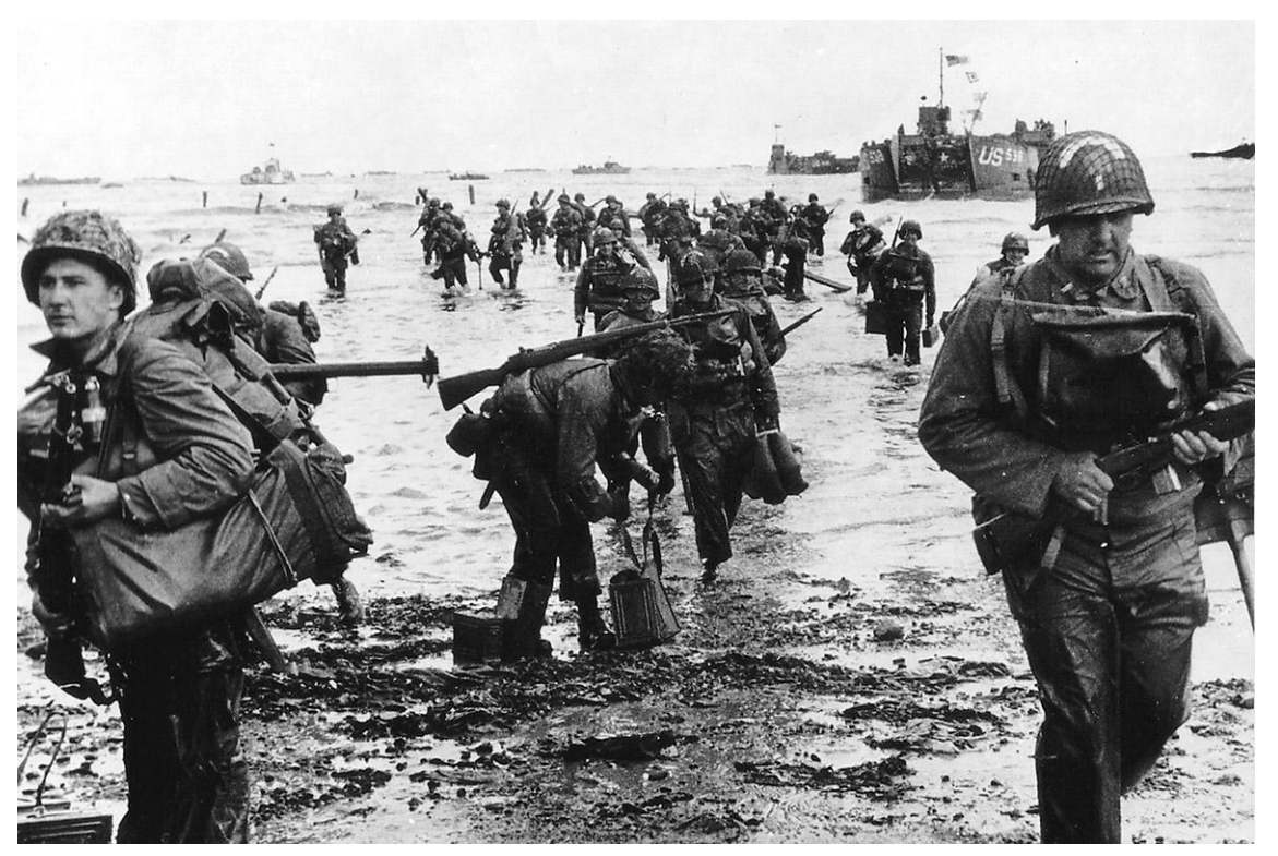
June 6, 1944: US reinforcements land on Omaha beach during the Normandy D-Day landings near Vierville sur Mer, France