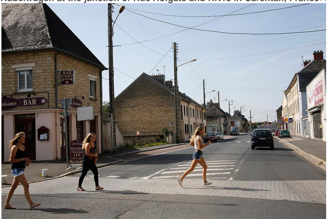
Girls run across the street at the junction of Rue Holgate and RN13 in the Normandy town of Carentan, France